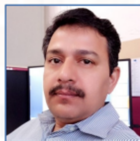
Assistant Professor DPAS, CUHP