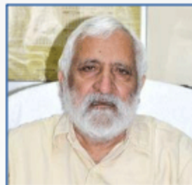
Hon. Vice-Chancellor Central Univ of H.P.